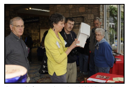
Inspect before you buy, then bid high to raise funds for nestbox supplies.

TBS Board Members* The Nature's Way* TopFlight Mealworms Troyer's Birds' Paradise* Wild Birds Unlimited, Kerrville