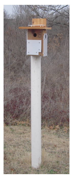
Completed nesting box with heat shields and faux holes designed and built by Troop 332 in Kaufman,

So with character and Bluebird nesting box building ahead of us, we set out. Most of the old wooden houses were in sad shape—the once tiny holes had been pecked wider and used by larger birds. The roofs of many were split open. As we approached one of