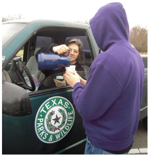
Texas Parks and Wildlife kept the project running with hot coffee

It was still dark at 7:00 on the morning of January 24 as I drove east from Dallas on Interstate 20 towards Lake Tawakoni State Park. The temperature was 34 degrees and the wind was blowing in hard from the north. Some of the gusts were 30 miles per hour. Trash and tree branches blew across the deserted highway. Out of nowhere a lone coyote appeared in my headlights only to disappear quickly, like a hallucination.