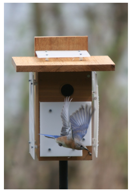
A female Bluebird decides to make the new nesting box her home.

the old nesting boxes near a clump of trees, a male Bluebird flew out and landed on the wire above our