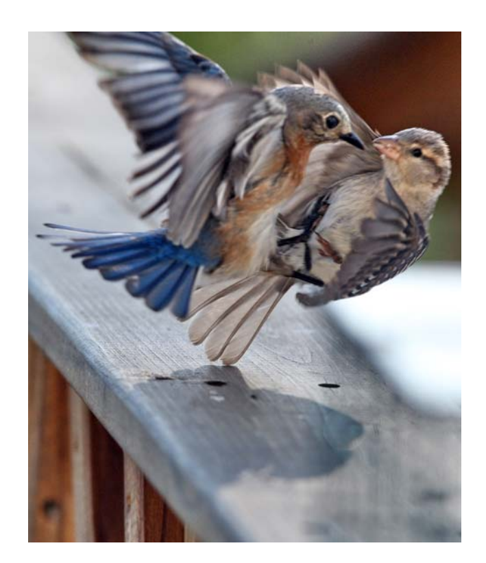
Photo courtesy of David Kinneer. A recent post on the Bluebird Forum of Gardenweb reported House Sparrow teamwork - the male HOSP chased the male bluebird while the female went into the box and killed the female bluebird.

This non-native bird must not be allowed to nest. House Sparrow graphics courtesy of Cornell Laboratory of Ornithology / Home Study Course