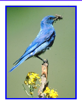
Male Western Bluebird.