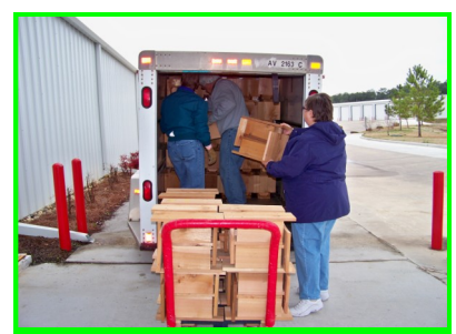
Many volunteers were needed.

whose diligence, dedication, and hard work made this event a huge success!