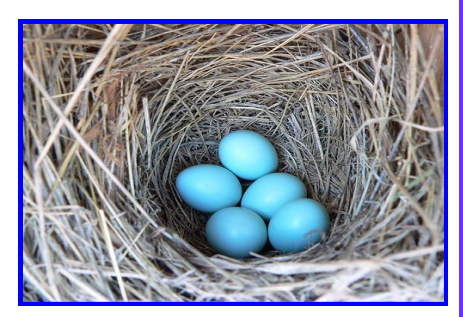
Eastern Bluebird nest in Jones State Forest, Montgomery County.