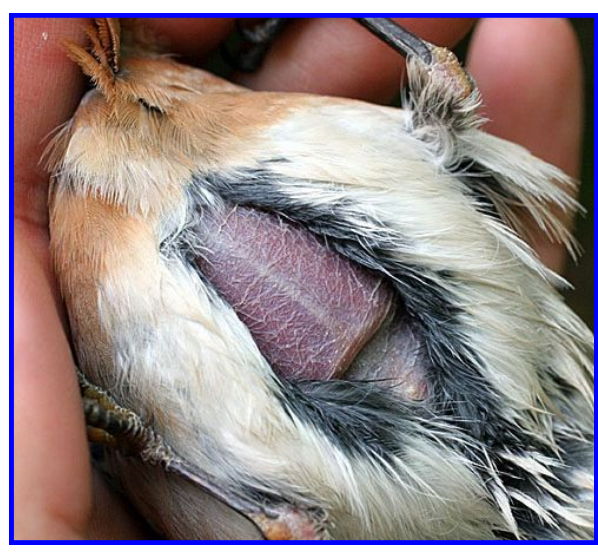
Brood Patch on female Eastern Bluebird. Photo by Bill Hilton, Jr

Permission to reprint photo from Hilton Pond Center for Piedmont Natural History www.hiltonpond.org "Blowing on her belly feathers revealed a well developed brood patch; devoid of feathers, infused with blood vessels, bare skin underlaid by a soft cushion of watery fluid." Bill Hilton Jr.