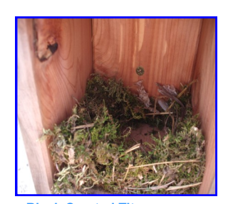
Black Crested Titmouse, our own Texas resident. Nest above, and top view of eggs below.

As part of courtship the male feeds the female while she quivers her wings and gives high pitched notes. This mate-feeding continues through nest building and the incubation phase. Like other small birds the Titmouse collects in large family flocks for the winter, separating again for the nesting season