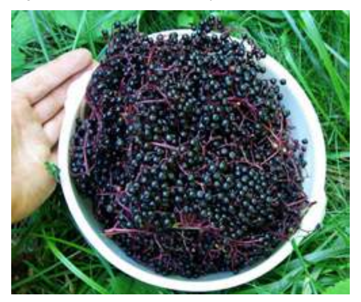
A great addition for both you and the birds in your backyard garden.

Elderberry is generally free of pests which makes it a great choice for the landscape. And who can argue with wine as a possibility from the fruit?